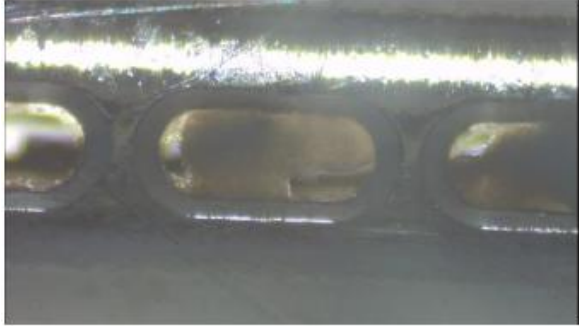
Non Activated shunt

HINGHAM, Mass., January 14, 2019 –Microbot Medical Inc. (NASDAQ: MBOT) announced today that it has validated the operational effectiveness of the Company's Self-Cleaning Shunt (SCS™) in a recent independent in-vitro laboratory study. The Company also shared images of its SCS™ from the laboratory study that clearly demonstrate the device prevented shunt occlusion.