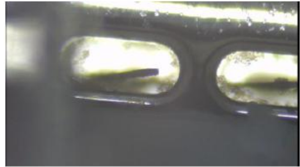
10 minutes post shunt activation